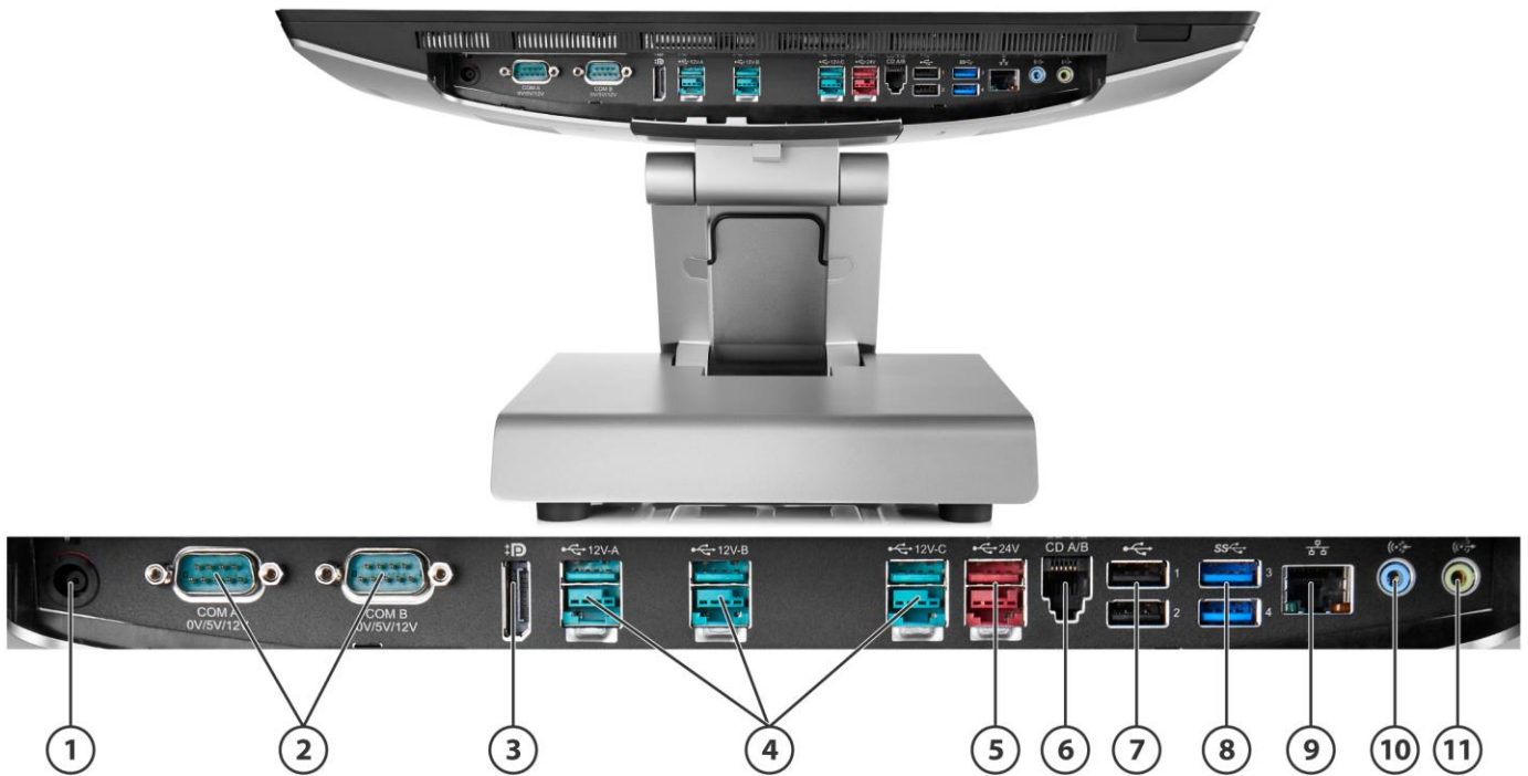
Image shown with ergonomic stand