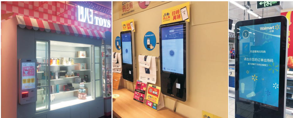
facepos kiosk successful use in End-user