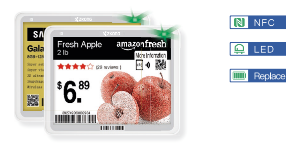
Size : 138.3*111.8*13.8mm Screen : 118.8*88.2mm Operate temperature : 0~40°C Battery: 2400mAh / 5years

Dot Matrix E-paper Black/White/Red (Yellow)